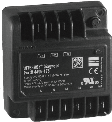
MOTOR PROTECTOR 4405-178